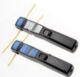
Live Fiber Identifier/ Tone Generator LFD-300B/TG-300B